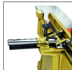
Large center-mounted fence with rack and pinion adjustment and ram lock. Positive stops for 90 and 45 degrees in and out.